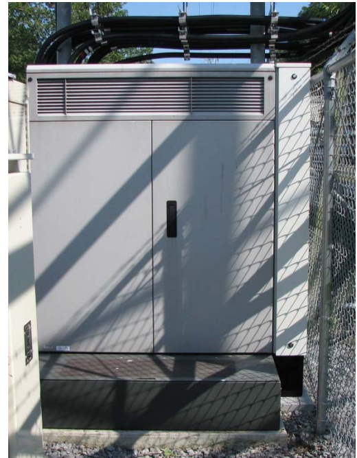
NT-BTS8000 Upgrade with BROSC-NT4-10